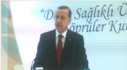
President of Turkey addressing the concluding session