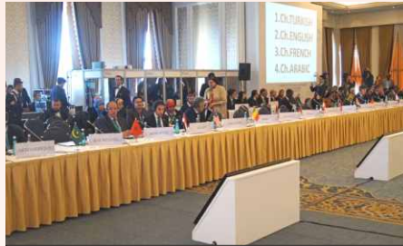
Day 2 of the 5th ICHM