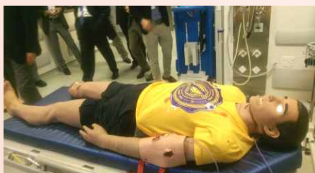
Field visit to robotic surgery center Achebadem Hospital