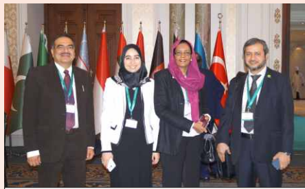
Panelist after the session