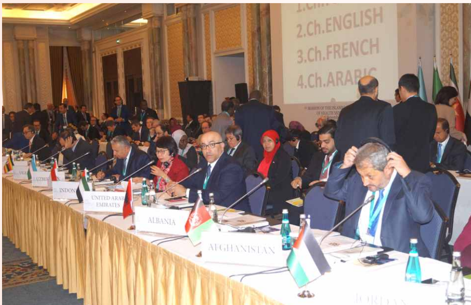
Panel discussion on IT addiction