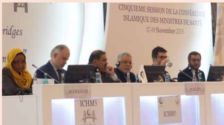
Panel discussion on Role of NGO's in Improving Healthcare in OIC Member States