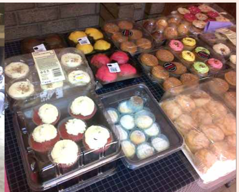
Islamic Medical Association, South Africa, Johannesburg branch held a breast cancer awareness workshop at the BMJ Hall in Benoni. Those that attended were asked to bring a box of cupcakes and these were handed out to the underprivileged at the Actonville Clinic. Alhamdulillah over 250 cupcakes were collected for the drive.