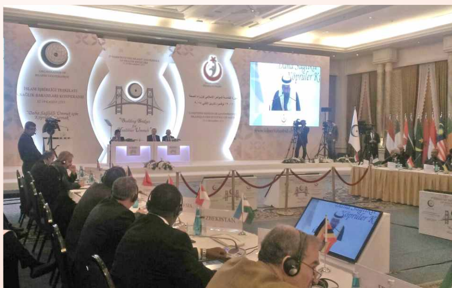
A view of the Opening Ceremony