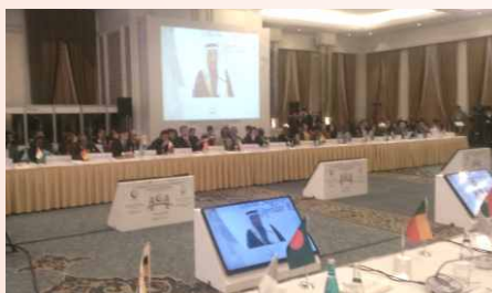
A view of the inaugural session of 5th ICHM

both globally and in OIC, and discussing strategies to exploit their potentials for enhanced collaboration with public sector. Examining and discussing the challenges and obstacles as well as the prospects for the development of an integrated approach among NGOs for better coordination for the implementation of OIC SHPA. Exploring the possibility of partnership in specific activities and programmes with relevant