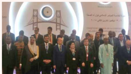
Group photo of Health Ministers attending 5th ICHM