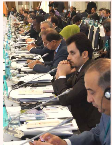
Health Ministers busy in taking notes

member countries. President of Republic of Turkey addressed the conference during its concluding session. President Recep Tayyip Erdogan urged the OIC Member States to accord high priority to health sector and take necessary steps towards ensuring healthy lives and promoting well-being for all at all ages and attaining health related targets in the SDGs and the SHPA; He stressed the Member States to take steps towards achieving universal health coverage, including financial risk protection, access to quality essential health-care services and