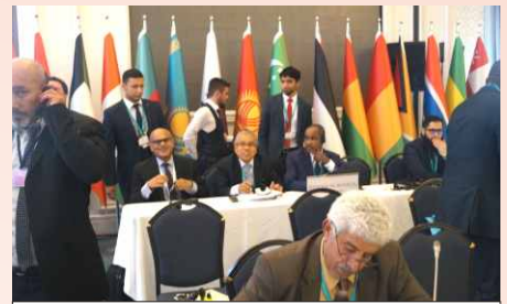
OIC Secretariat Staff busy with the arrangements