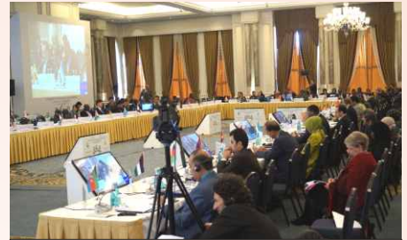
Day 2 of the 5th ICHM