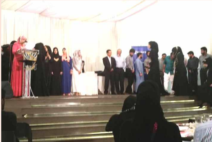
Islamic Medical Association of South Africa , Durban branch arranged a graduates dinner. Awards distribution at Graduates dinner.